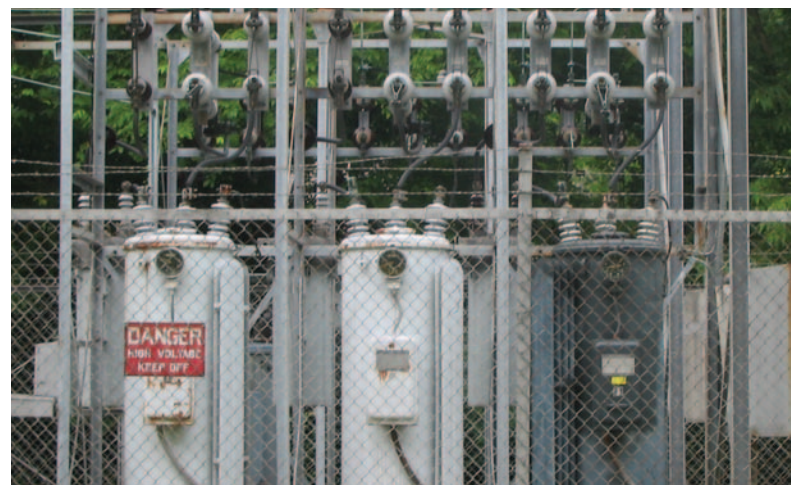
Examine transformers, comparing similar connections under similar loads.

However, if the metal surface of a motor casing is shiny, it looks like a mirror in the infrared region. Instead of seeing the temperature of the motor, the infrared camera "sees" a combination of some of the heat of the motor and some of the heat of objects around the motor. To compensate, thermographers paint a black spot on the surface or use a contact temperature probe to allow them to adjust the emissivity until the infrared reading matches the contact probe.